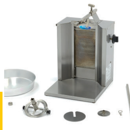
Easy to dismantle and clean