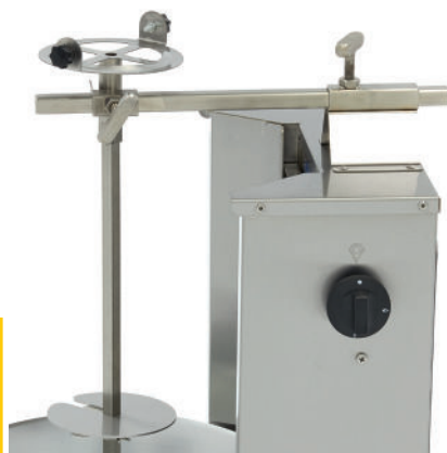
With adjustable skewer for perfect preparation.