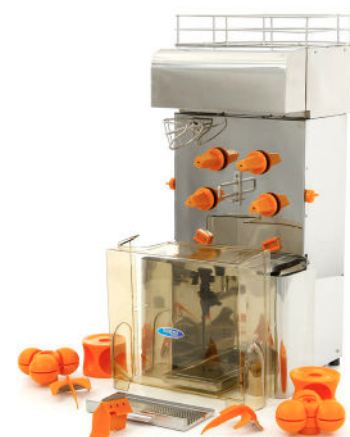
Easy to dismantle and clean