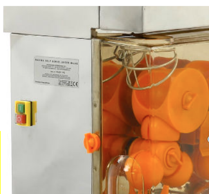
Anticorrosive press parts and on-off switch on the side